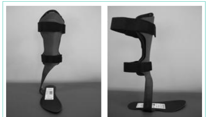
Figure 1: Dynamic carbon ground reaction ankle foot orthotic.