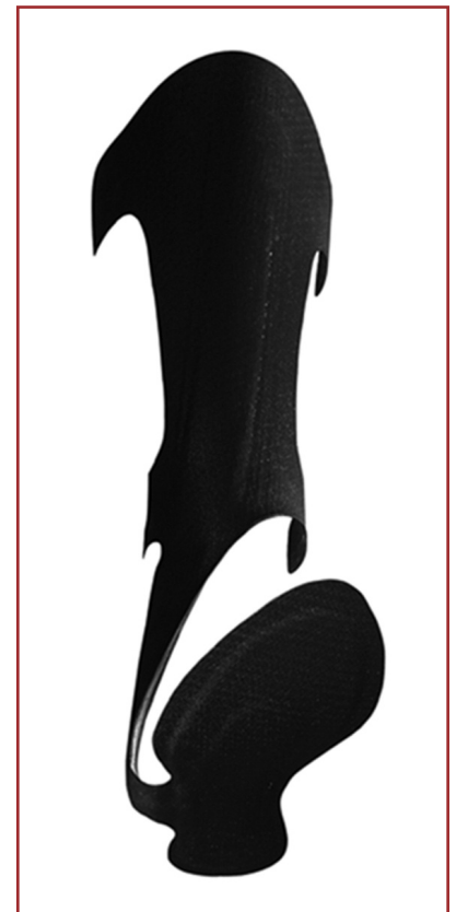
Figure 3. Kinetic return ankle foot orthosis.

The data suggest that use of a KRAFO may engage the calf muscles during physical activity. The slight but statistically significant increase in mean calf size observed over the eight-week period is very encouraging, especially considering that muscle hypertrophy does not begin until at least